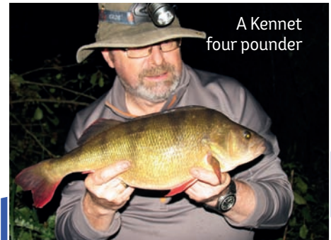
A Kennet four pounder

Our big pits produce big pike like these beauties from Pingewood and Sonning Eye.