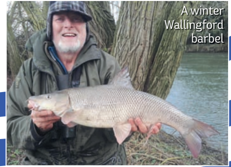
A winter Wallingford barbel

Record breaking fish have come from our famous waters and probably will do again.