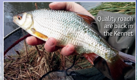
Quality roach are back in the Kennet

SEE THE GREAT VENUES WE HAVE TO OFFER AT: www.rdaa.co.uk/venues