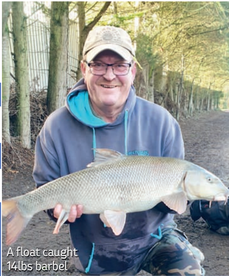
A float caught 14lbs barbel