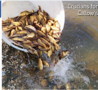
Crucians for Callow's