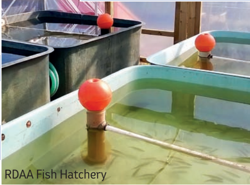
RDAA Fish Hatchery