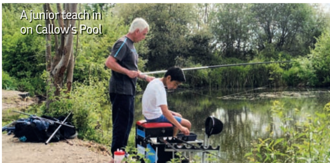
A junior teach in on Callow's Pool

The Association actively encourages young people to take up angling and has a dedicated core of qualified angling coaches and helpers who regularly host junior coaching events throughout the summer months. All sessions are free of charge with tackle provided. The development of our new facilities at Pingewood provide us with the perfect environment with three well stocked pools offering plenty of bites and the action that youngsters need. The venue boasts a flushing toilet and café with tea and coffee available for Mum and Dad.