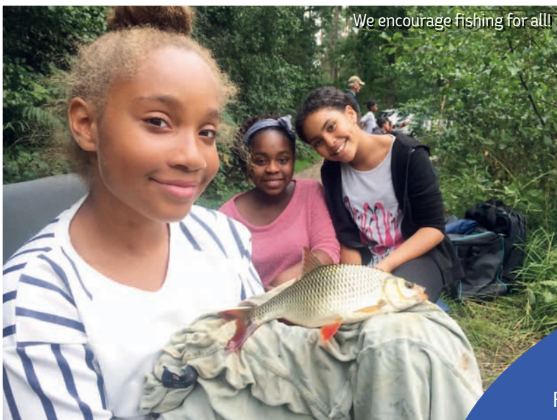
We encourage fishing for all

Dates of coaching sessions will be advertised on the RDAA web site at www.rdaa.co.uk/junior-information