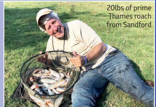
20lbs of prime Thames roach from Sandford

And if the rivers are out of sorts there's plenty of perch, roach and bream to target on our many sections of the Kennet & Avon canal.