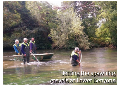
Jetting the spawning gravels at Lower Benyons

Our drive to improve fishing opportunities for our members will not stop. We will continue work on habitat improvements to the river Kennet and to our lakes to improve spawning and fish recruitment. We have a new Fisheries Management Committee and a programme of volunteer work parties focused on improving access and opening up more and better fishing.